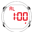
Alarm Setting Display