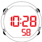
Time Setting Display